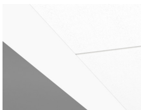
Focus D/A for Bandraster