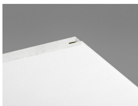
Focus D/A tile